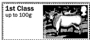
Two of the 6 stamps in the latest set.

..... NEXT, WE HAVE ANOTHER ISSUE OF "POST & GO" STAMPS From