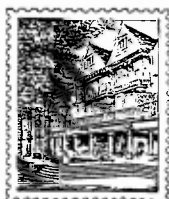
ROYAL TUNBRIDGE WELLS

Royal Tunbridge Wells PS For those of you wishing to find us on the Internet, PLEASE NOTE that our web-site is NOW www.rtwphilsoc.co.uk and NO OTHER ! Any other is not controlled by the Society and is NOT in any way official. Please also note that we have changed the venue for our morning meetings. We are now using The Spread Eagle, Forest Road, Hawkenbury, Tunbridge Wells, TN2 5BT. Meetings commence at 10.30 am, on the third Thursday each month. Other