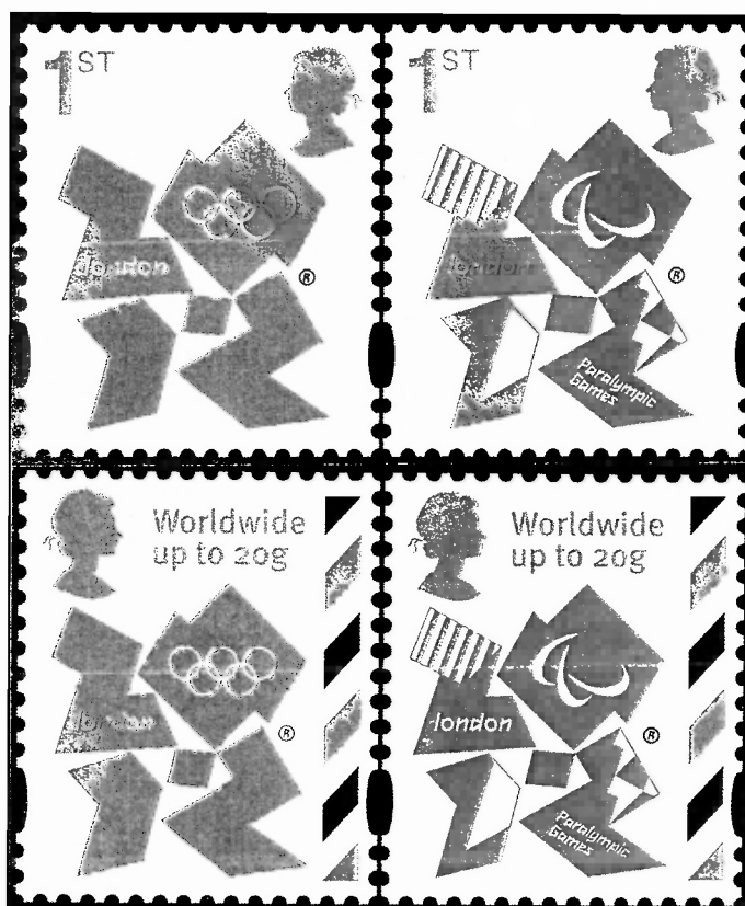
The LONDON 2012 OLYMPIC GAMES and PARALYMPIC GAMES Definitive stamps (see under New Issues inside)