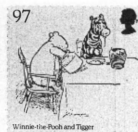
97 Winnie-the-Pooh and Tigger 97p, world airmail up to 20g: Pooh discovers that Tiggers don't like honey

are slightly smaller than the basic set, but - why ? The issue is linked to the 'Europa' theme so one wonders why only the 1st class stamps have the word 'Europa' on them and why its in such small print. The Queen's head is in red with the rest of the design in black. The stamps are printed by Lithography by Cartor Security Printing but the Presentation Pack is printed by Walsall Security Printers and a set of 11 postcards (it is assumed that one card shows the mini sheet complete) and a first day envelope, have been printed by the Fulmar Colour Printing Co. Ltd.