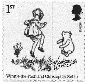
1st Winnie-the-Pooh and Christopher Robin First-class inland letter rate: The friends Pooh, Piglet and Christopher Robin

On 12th October, 'POOH BEAR' is featured on a set of 6 stamps, in a yellowish colouring, maybe a palish honey colour ?) This issue is in the EUROPA theme, on Childrens Books, The cost being £4.11 for the basic set. There is a miniature sheet of four different stamps, with a 1st class, a 60p, an 88p and the 97p, costing £2.86. (say £7 for the lot ! All four of the stamps on the miniature sheet