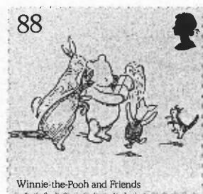
88 Winnie-the-Pooh and Friends 88p, Europe up to 40g: Pooh is joined by Rabbit, Kanga, Roo, Owl and Piglet for a party