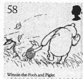
58 Winnie-the-Pooh and Piglet 58p basic rate worldwide: Pooh and Piglet walk into the wind on their way to Kanga's